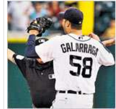
The Perfect Asterisk