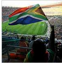
South Africa Scores!