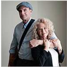
Touchstones in Concert, Reweaving Harmonies